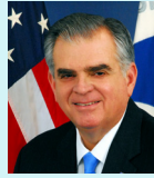
The Honorable Ray LaHood, secretary of transportation, U.S. DOT

Secretary LaHood's comments echoed and reinforced the focus on partnerships that resonated during the previous discussions. He placed particular emphasis on the importance of mentoring – stating that there is a shortage of transportation workforce mentors. He encouraged the Summit participants to become mentors within their industries, organizations and communities. Mentors who work individually with students and new employees not only teach them valuable skills, but also welcome them into the industry, instilling a level of camaraderie and